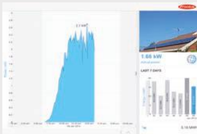
Fronius Solar.web App