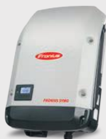
/ FRONIUS SYMO 3.0 - 20.0 kW 3-phase