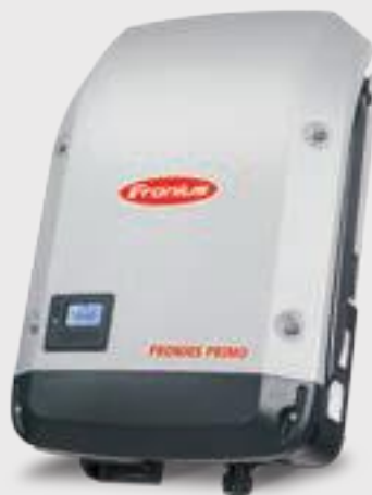
/ FRONIUS PRIMO 3.0 - 8.2 kW 1-phase