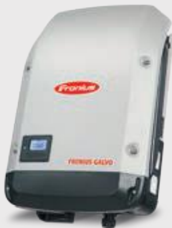
/ FRONIUS GALVO 1.5 - 3.1 kW 1-phase

perfectly optimised for your self-consumption system. Now, for the first time, the inverters are also equipped with a WLAN interface inside the device. Your photovoltaic system is therefore wirelessly connected to the internet so you can call up your system data whenever you want.